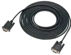
Omron PLC SYSMAC Link Cable (5m) CA3-CBLSYS-01 Connects Omron PLC SYSMAC Series unit to the AGP RS-232C port.