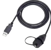
USB Front Cable (1m) CA5-USBEXT-01 USB extension cable.