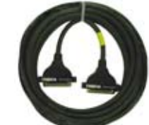
RS-232C Cross Type Cable (5m) GP410-IS00-O 25 pin D-sub connector both ends. Requires CA3-CBLCBT232-01.