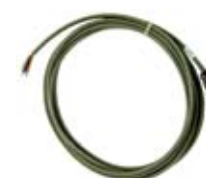
PLC Adapter Cable HMI-CAB-ST001 Connects to AGP3000/ST40x serial port with 9 conductor open ended wires for connecting to 3rd party screw terminal devices.