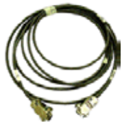
Allen Bradley SLC 5/03, 5/04 Series Cable HMI-CAB-ST52 HMI-CAB-ST52-30X HMI-CAB-ST52-50X Connects AGP3000/ST401 to AB PLC via RS-232 9 pin D-sub.