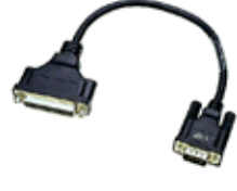
9-pin-to-25-pin RS-422 Conversion Cable CA3-CBLCBT422-01 9-pin D-sub socket to 25-pin RS-422 cable adapter (for use with some HMI-CAB-Cxxx cables).