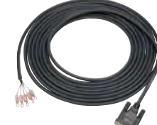
GP 2 Port Adapter Cable (5m) CA3-MDCB11 Connects Mitsubishi PLC to the AGP RS-422 port using 2 port adapter II (GP070-MD11).