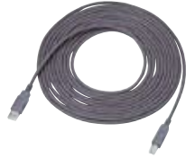
USB Cable (5m) FP-US00 Connects a USB printer (TYPE-B) port to AGP's USB port.