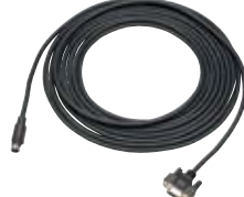
Mitsubishi PLC Q-Series Cable (5m) CA3-CBLQ-01 Connects Mitsubishi PLC Q-Series programming console port to AGP. Connection Cable.