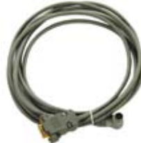
Micrologix PLC Cable HMI-CAB-ST106 Connects AGP3000/ST401 to PLC RS-232 8 pin DIN port.