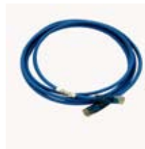
Ethernet Crossover Cable HMI-CAB-ETH 6-ft. HMI to PLC Ethernet port or to program HMI.