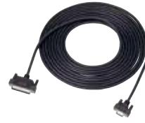
RS-232C Cable (5m) CA3-CBL232/5M-01 Connects Mitsubishi PLC A-Series to the AGP RS-232C COM port.