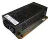
1-Amp Power Supply 510-1000-004 2-Amp Power Supply 510-1000-041 24VDC Din Rail Mount Class 1 Div 2