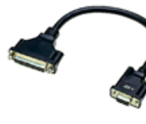
9-pin-to-25-pin RS-232C Conversion Cable CA3-CBLCBT232-01 9-pin D-sub socket to 25-pin RS-232 cable adapter (for use with some HMI-CAB-Cxxx cables).