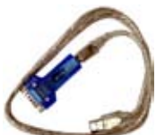
Serial USB cable for modem download CA6-USB232-01