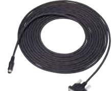
Mitsubishi PLC FX-Series Cable (5m) CA3-CBLFX/5M-01 (5m) CA3-CBLFX/1M-01 (1m) Connects Mitsubishi PLC FX-Series programming console port to AGP RS-422 COM port.