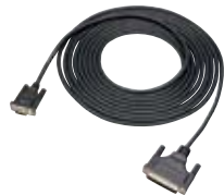
Mitsubishi PLC A-Series Connection Cable (5m) CA3-CBLA-01 Connects Mitsubishi PLC A-Series and QnA-Series programming console port to AGP.