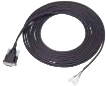
RS-422 Cable (5m) CA3-CBL422/5M-01 Connects the AGP RS-422 COM port 1 via 9-pin socket to host controller via open wires .