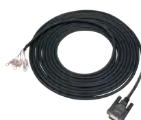
GP Multi-Link Cable (5m) CA3-CBLMLT-01 Connects a host controller to the AGP RS-422 port for multi-link (n:1) communication.