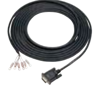
GP RS-422 Cable (5m) CA3-CBL422-01 Connects the AGP RS-422 COM port 2 via 9-pin plug to host controller via open wires.