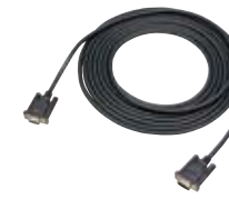
Mitsubishi PLC Q-Series Cable (5m) CA3-CBLLNKMQ-01 Connects Mitsubishi PLC Q-Series to the AGP RS-232C COM port. Link Cable.