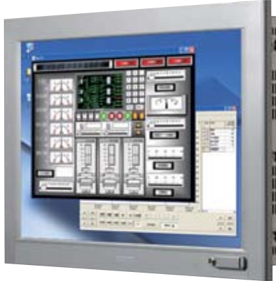
Figure is FP3900-T41-U